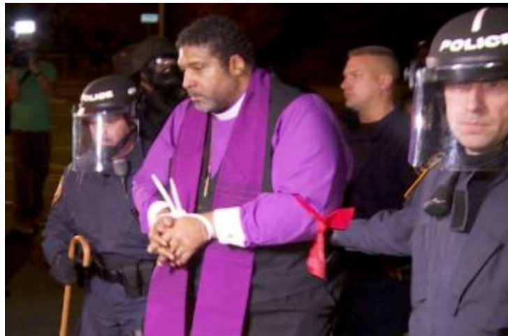
Rev. William S. Barber II was arrested many times at Moral Mondays protests.

This short, inexpensive book is a sermon encapsulating the biblical ideals behind Barber's Poor People's Campaign. The movement works toward achieving a more economically just and equal nation. Barber is senior pastor of Greenleaf Christian Church (Disciples of Christ) in Goldsboro, N.C. He was president of the North Carolina NAACP for a decade and is visiting professor of public theology and activism at Union Theological Seminary in New York. He was a MacArthur Fellow in 2018.