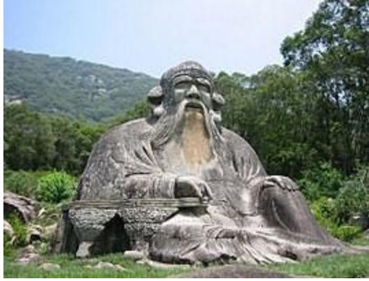
Sculpture of Lao Tzu (also Laozi), the reputed author of the Tao Te Ching.

To sift through the many translations available, you can read about them on the Shambhala website . Among the highly recommended translations are those by Stephen Mitchell and Ursula LaGuin.