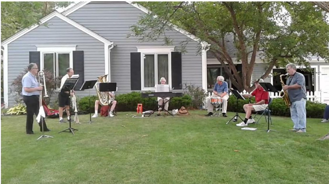
Swing Low, Sweet Chariot performed by the Stover Street Stompers.

“Nobody Knows the Trouble I’ve Seen” appears in that 1867 Anthology. “Swing Low Sweet Chariot,” one of the best known and most beloved slave songs, has two enticing historical narratives. An online search for “History of Swing Low, Sweet Chariot” will yield these stories.