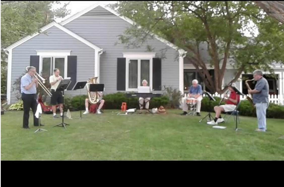
Nobody Knows the Trouble I've Seen performed by the Stover Street Stompers.