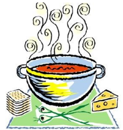
Double Nickel Lunch

J oin us for the Friday, August 12, Double Nickel Lunch at noon in Fellowship Hall when we will be entertained and inspired by a concert presented by our own Stover Street Stompers , an outreach ministry of our church. The band plays Dixieland tunes, gospel songs, spirituals, and traditional hymns for churches in northern Colorado, and performs in nursing homes, and at various community and charitable events. They recently performed at the annual Walker Hymn sing in Timnath which drew an audience of over 1000.