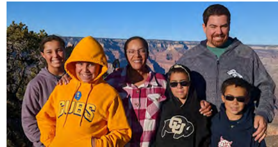
The Diaz Family