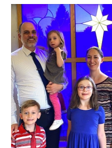
The Hodge Family