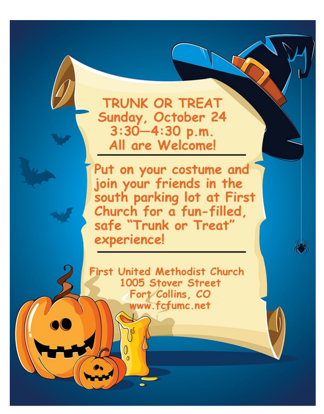
WELCOMING, HOSPITALITY & DISCIPLESHIP

CANCELLED: Chili Cookoff Due to very few people signing up to bring chili to compete in the competition or share with others, we are CANCELLING the Chili Cookoff event scheduled on October 24. Trunk or Treat will continue with a hot chocolate bar run by the Youth as a Fundraiser for the Youth Mission Trip.