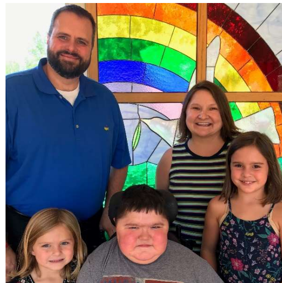
The Barkoskie Family