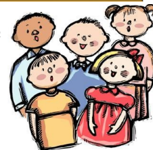
Joyful Noise Choir