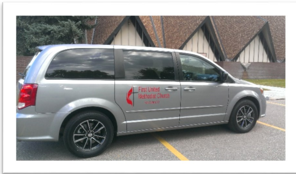
THE MAKINEN MINI